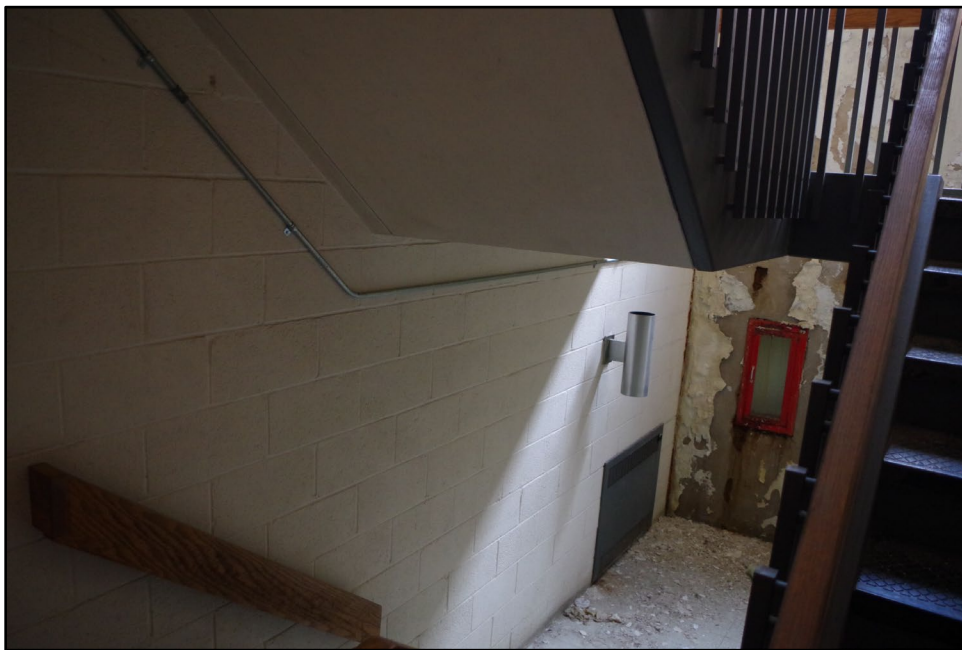
Photograph 36: General interior overview of Building 11A.