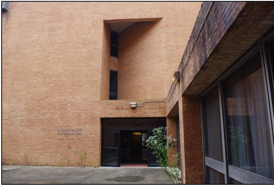
Photograph 15: View of main entry, camera facing northeast.