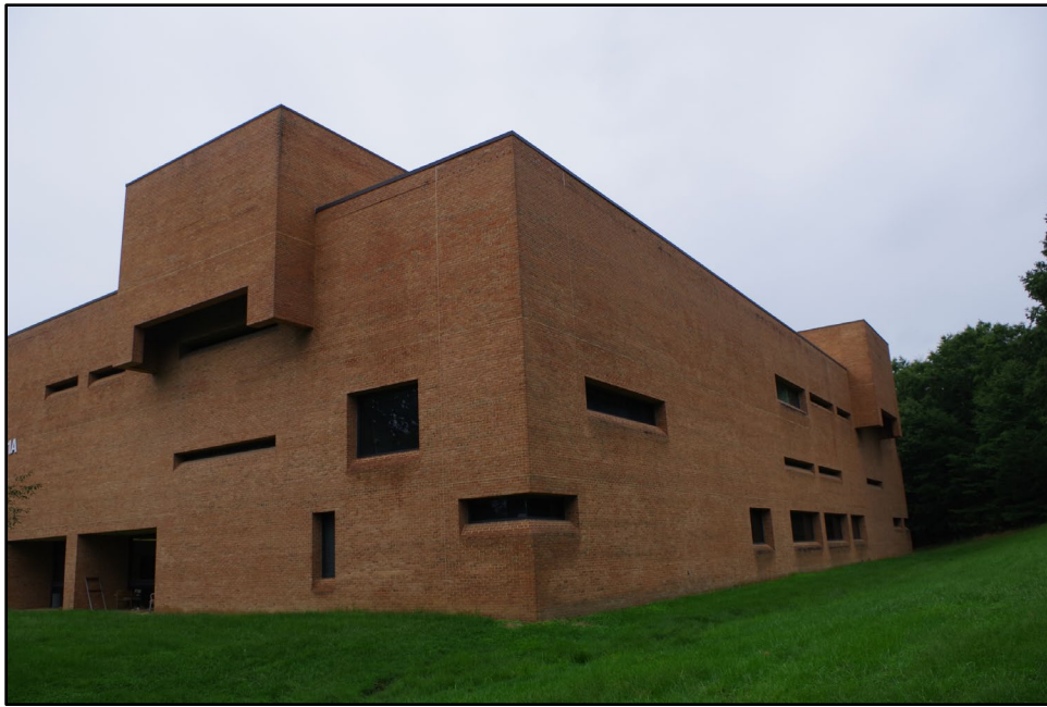
Photograph 11: View of intersection of southeast and northeast façade, camera facing southwest.