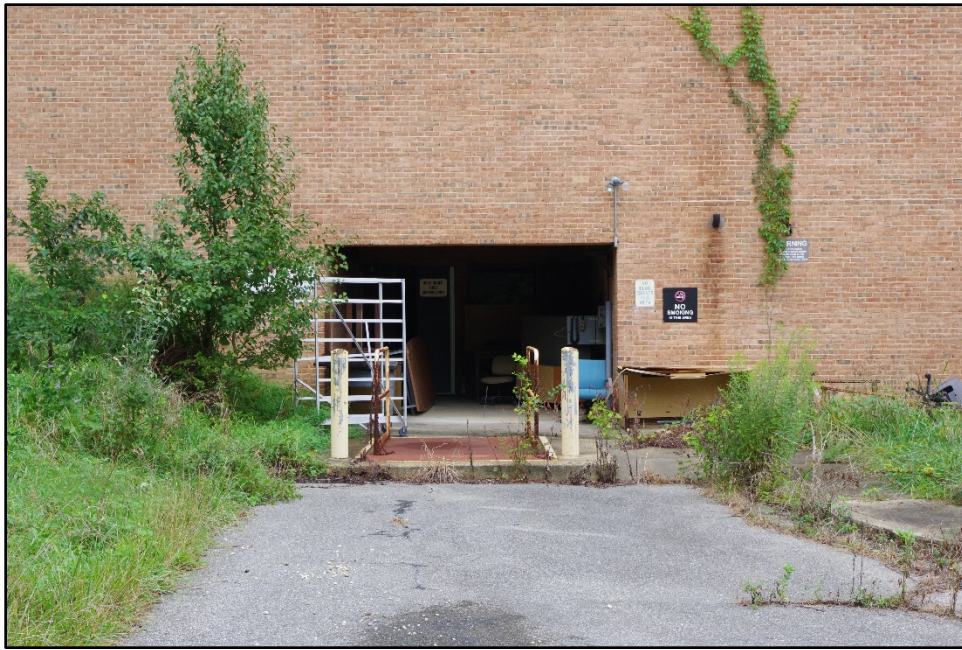
Photograph 7: View of bay entry on northwestern façade, camera facing southeast.