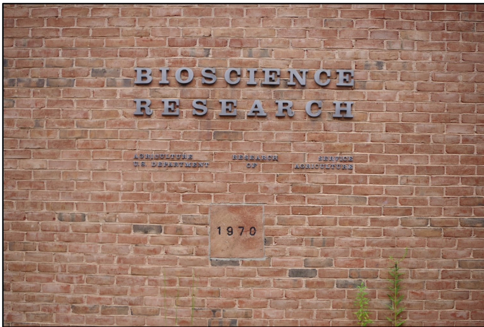
Photograph 16: View of signage and cornerstone at main entrance, camera facing northeast.