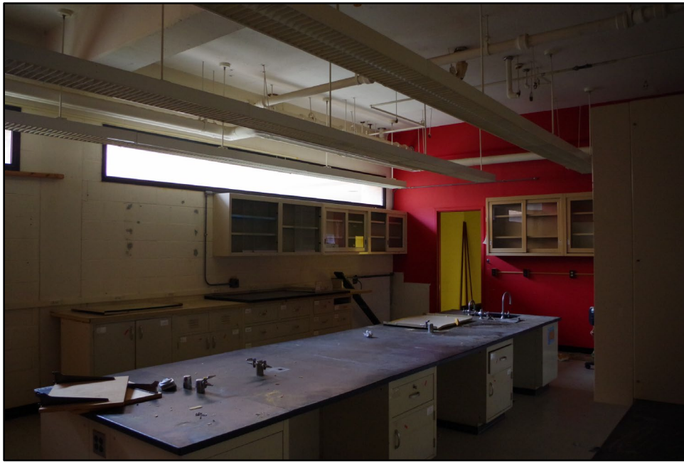
Photograph 33: General interior overview of Building 11A.