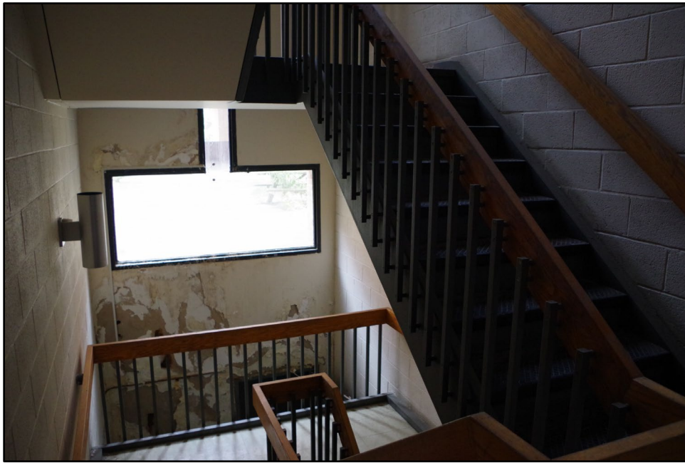
Photograph 35: General interior overview of Building 11A.