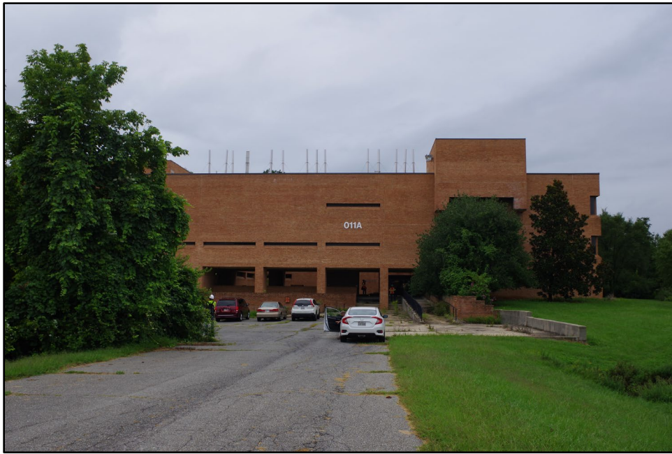
Photograph 1: View of southwest façade, camera facing northeast.