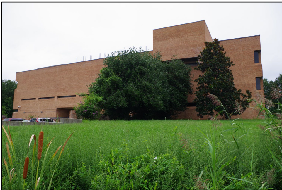
Photograph 2: View of southwest façade, camera facing north.

USDA – Beltsville Agricultural Research Center Demolition of Building 11A