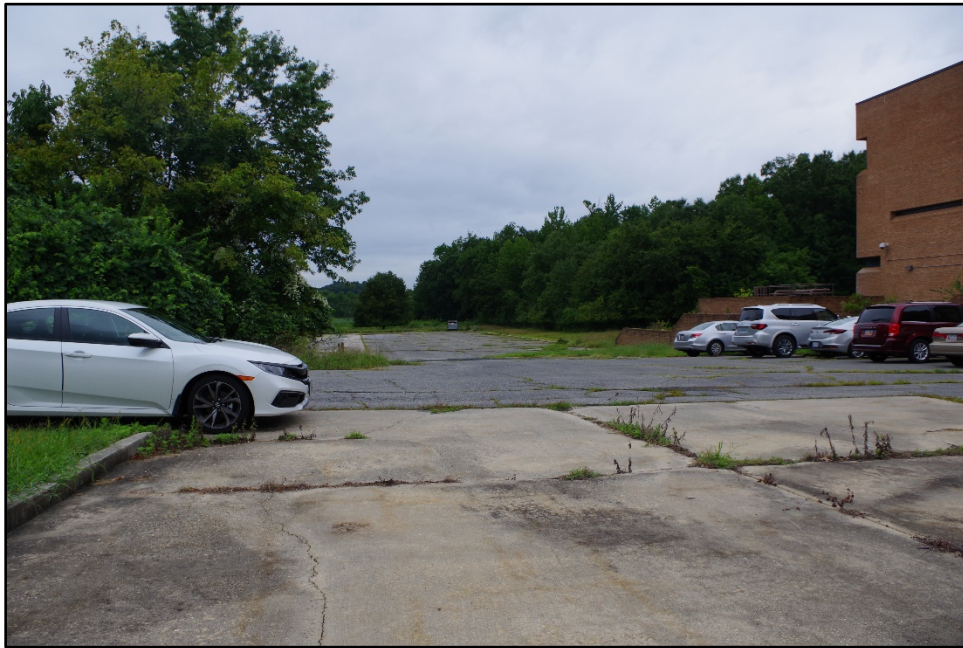
Photograph 18: View of parking lot associated with Building 11A, camera facing northwest.