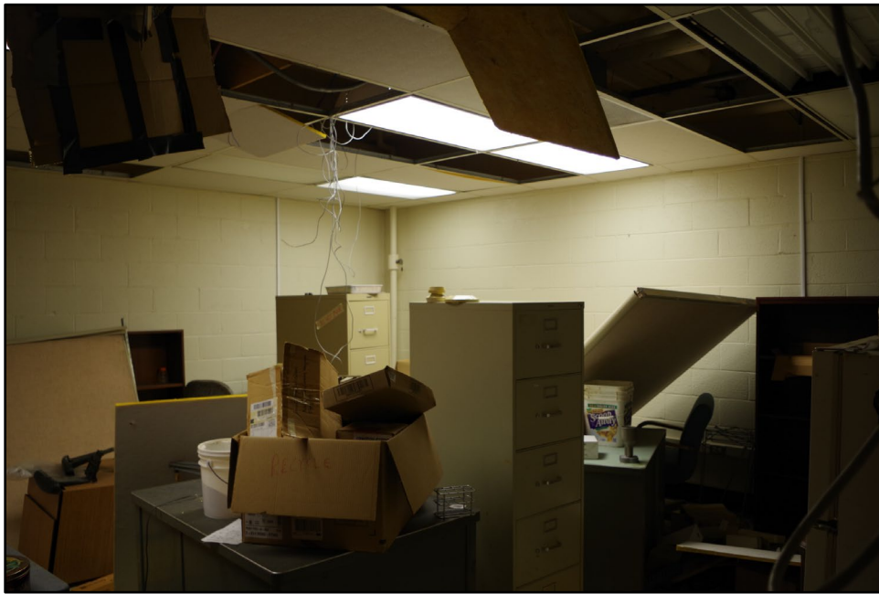
Photograph 26: General interior overview of Building 11A.