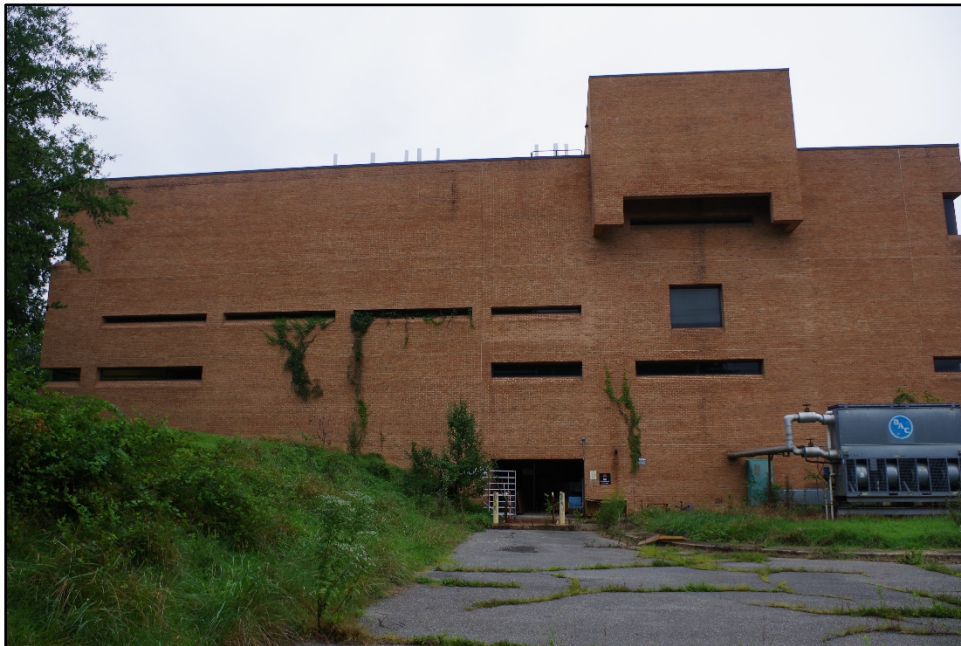
Photograph 6: View of northwestern façade, camera facing east-southeast.