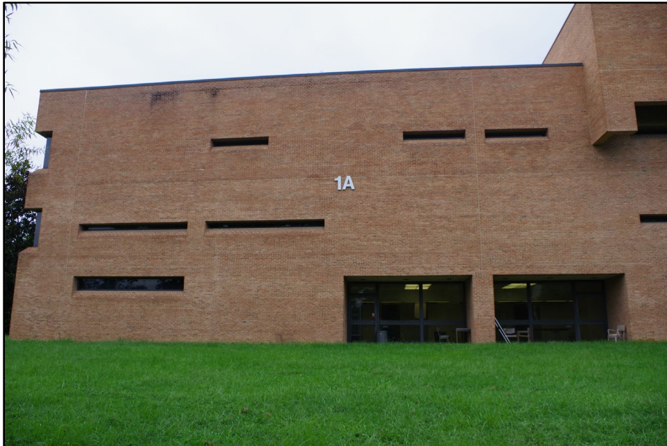
Photograph 12: View of southeast façade, camera facing northwest.