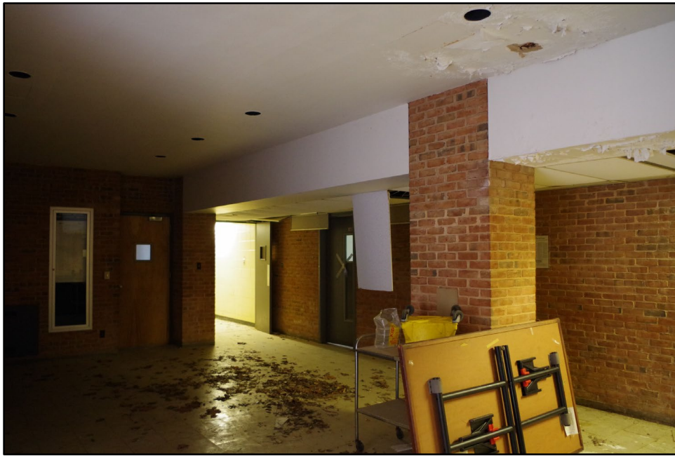
Photograph 21: General interior overview of Building 11A.