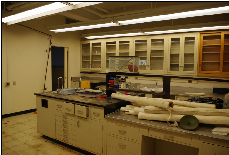
Photograph 22: General interior overview of Building 11A.