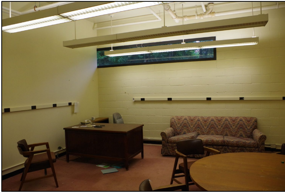
Photograph 31: General interior overview of Building 11A.