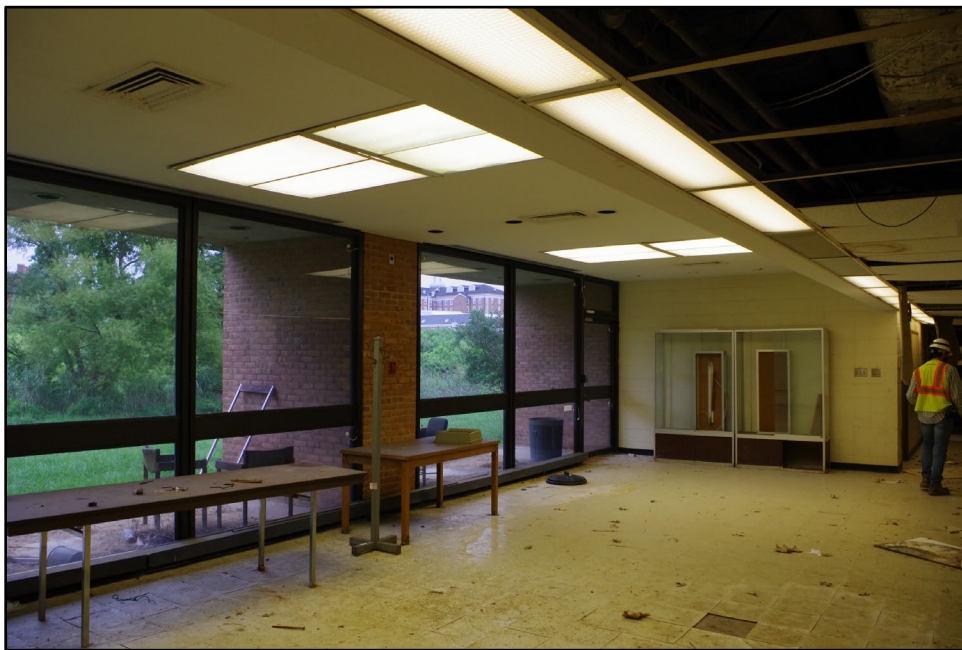
Photograph 24: General interior overview of Building 11A.