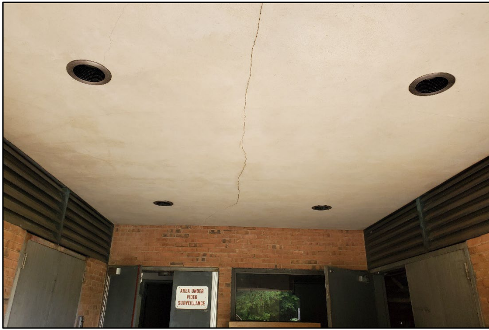
Photograph 17: View of covered entrance to Building 11A.