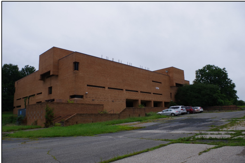
Photograph 4: View of southwest façade, camera facing northeast.