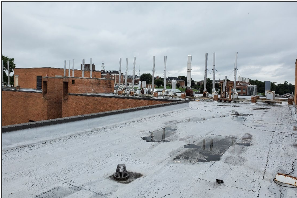
Photograph 20: Partial view of rooftop machinery and entrance, camera facing southeast.