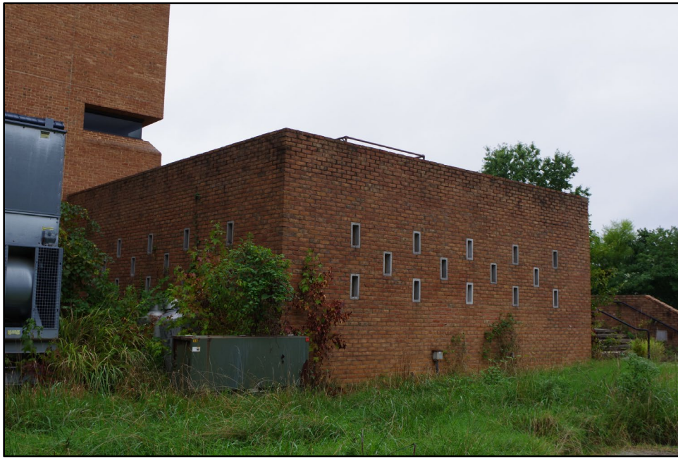
Photograph 9: View of brick wall shielding utility machinery on the northwest façade, camera facing south.