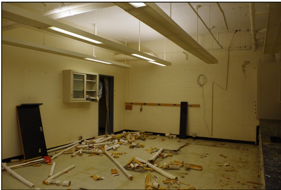
Photograph 28: General interior overview of Building 11A.