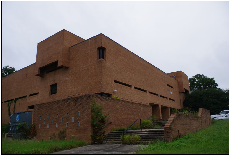
Photograph 5: View of main entry stair at intersection of southwest and northwest façade, camera facing northeast.