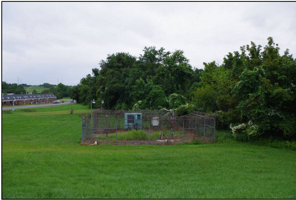
Photograph 19: View of pumping station associated with Building 11A, camera facing west.