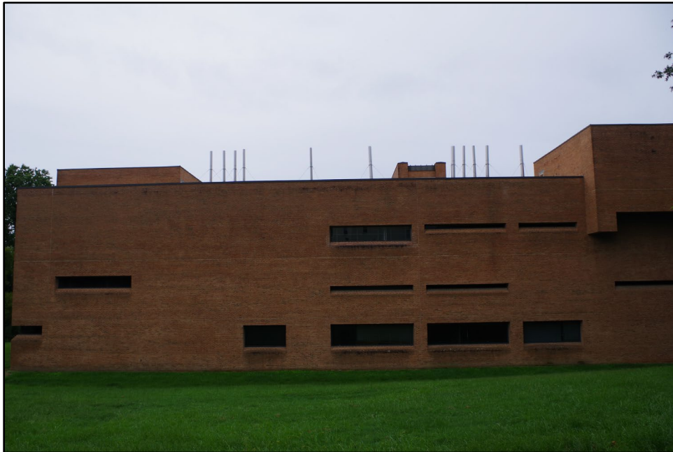
Photograph 10: View of northeast façade, camera facing south-southeast.