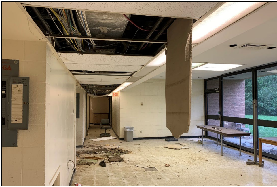
Photograph 23: General interior overview of Building 11A.