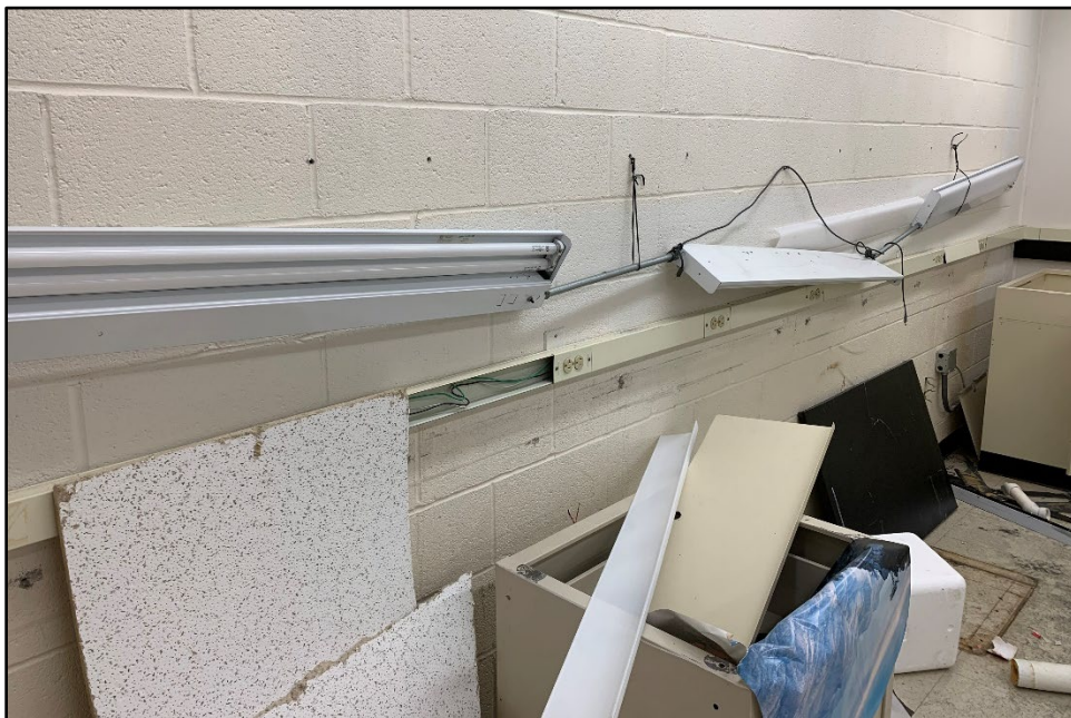
Photograph 32: General interior overview of Building 11A.