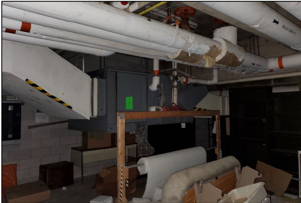
Photograph 38: General interior overview of Building 11A.