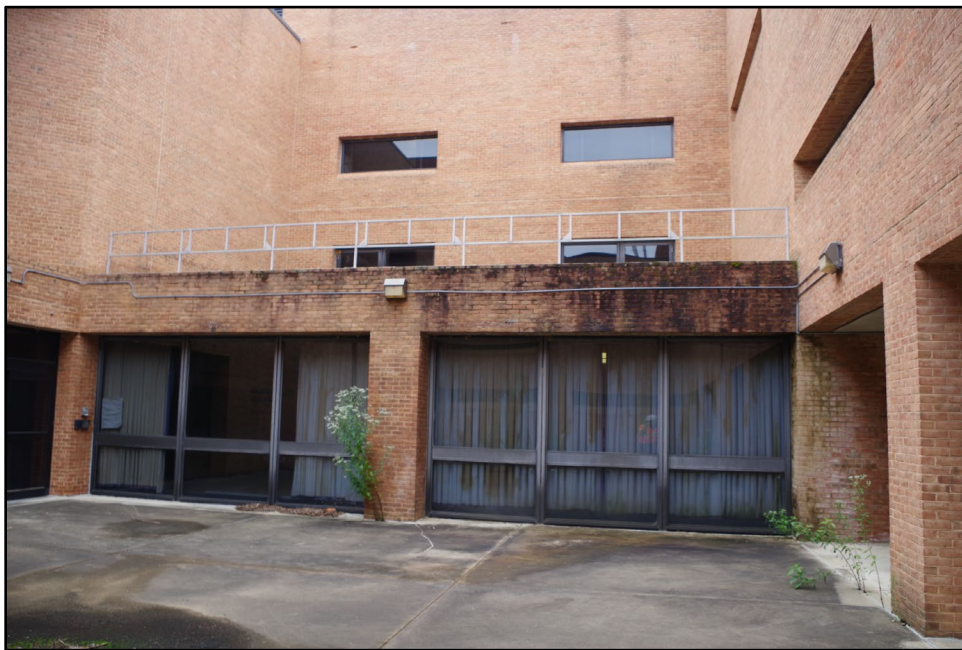
Photograph 14: View of courtyard, camera facing southeast.

USDA – Beltsville Agricultural Research Center Demolition of Building 11A