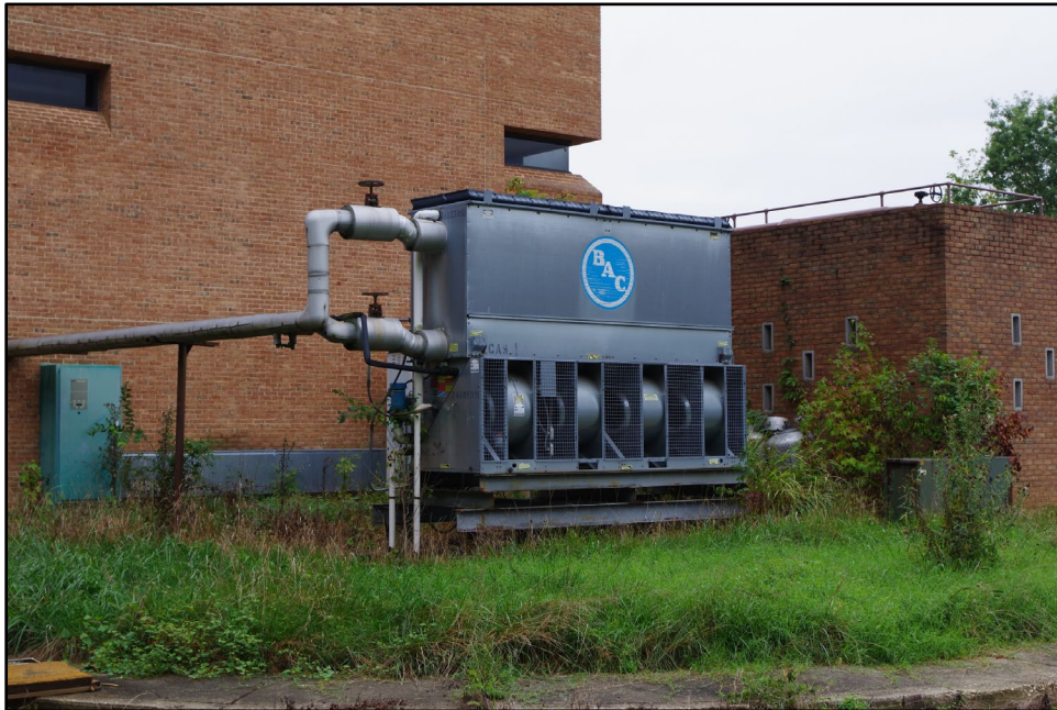
Photograph 8: View of air conditioning unit on northwestern façade, camera facing south.