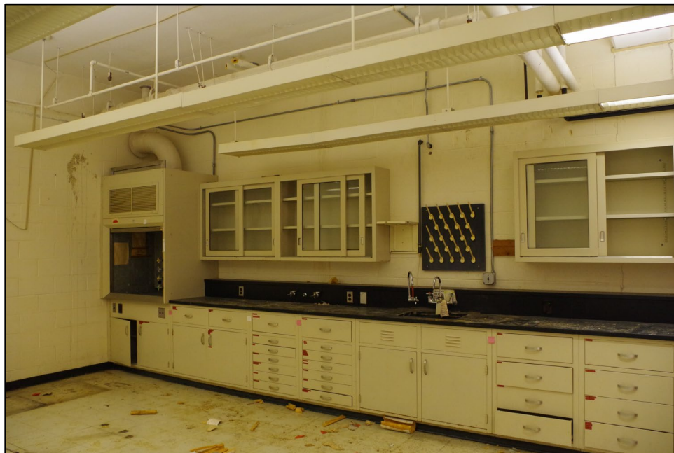
Photograph 30: General interior overview of Building 11A.