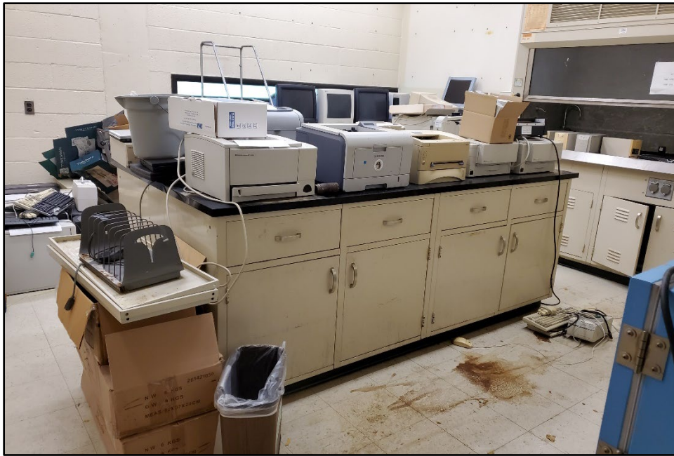
Photograph 27: General interior overview of Building 11A.