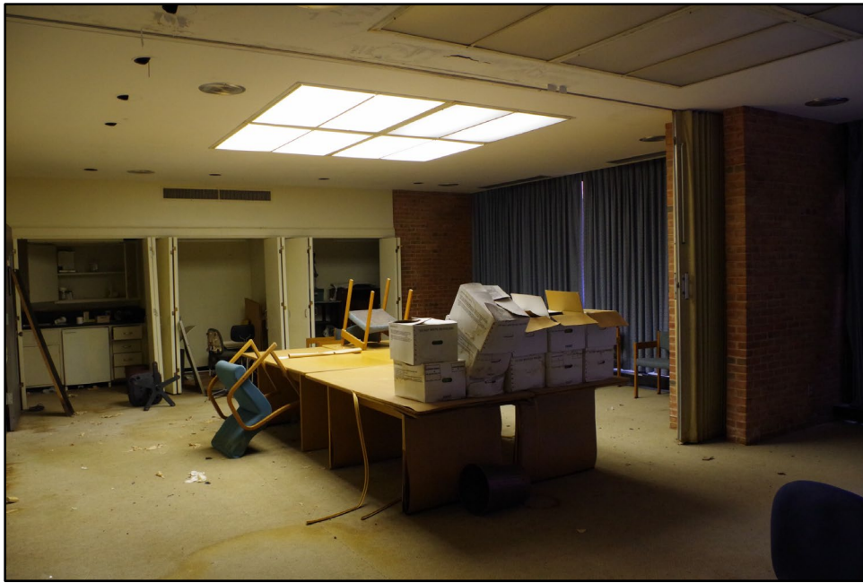
Photograph 25: General interior overview of Building 11A.