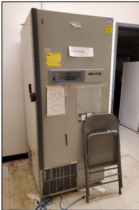
Photograph 34: General interior overview of Building 11A.