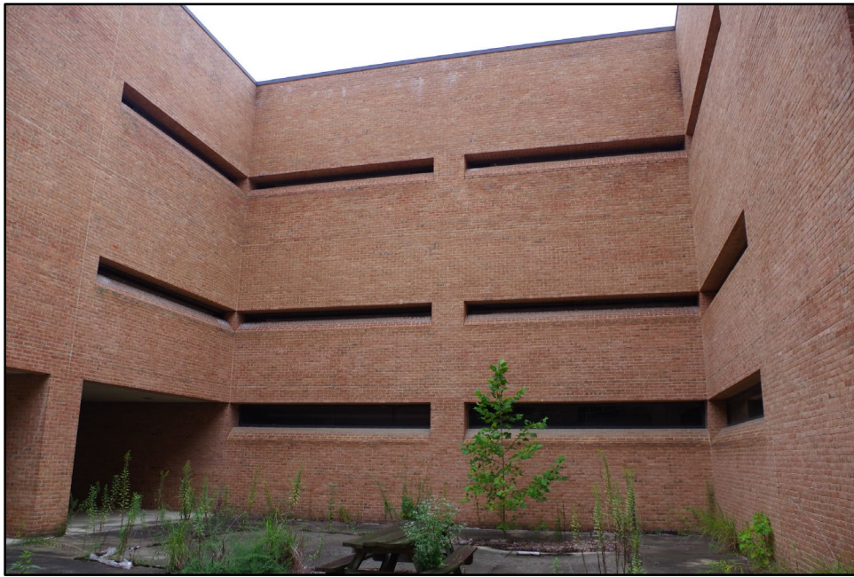
Photograph 13: View of courtyard, camera facing west.