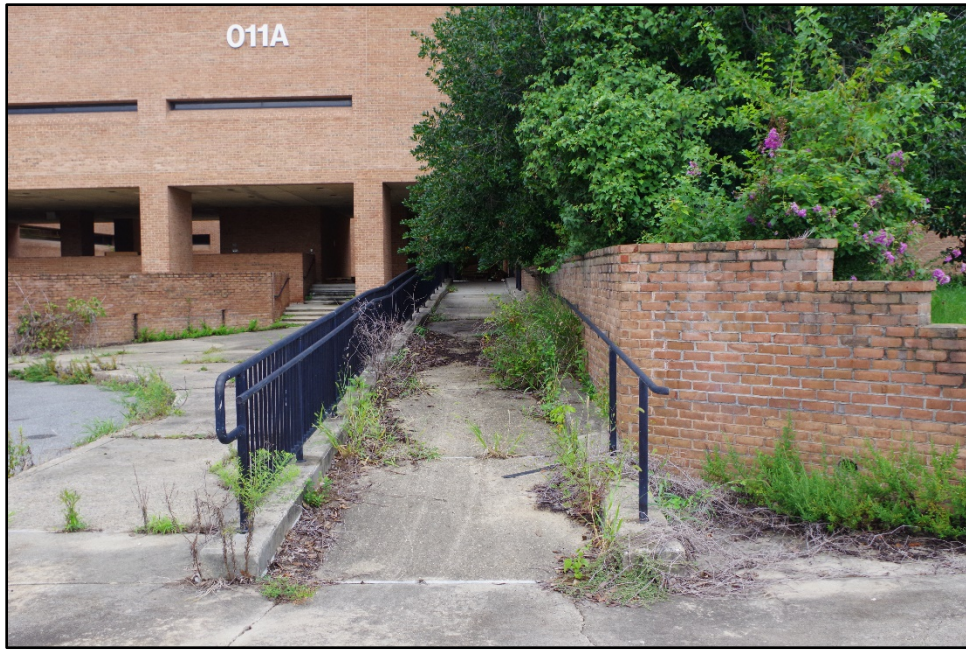
Photograph 3: View of perimeter wall and entry ramp on southwest façade, camera facing north.